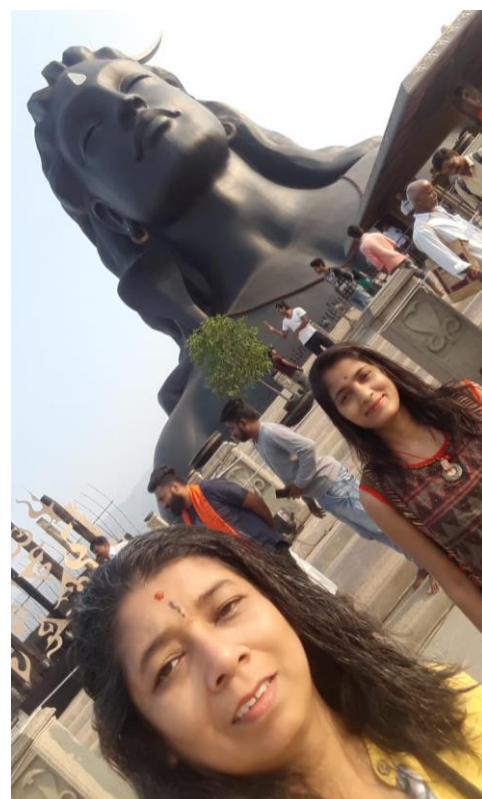
HFA team during Mahashivratri celebration at Isha Yoga Centre, Coimbatore

Please visit our website or follow us on Twitter, facebook, and YouTube for regular updates! We would love to hear from you—write to us at info@heartforart.co.in with any feedback or query.