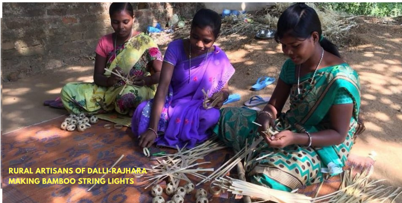
RURAL ARTISANS OF DALLI-RAJHARA MAKING BAMBOO STRING LIGHTS