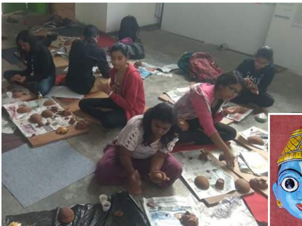
CHERIAL MASK MAKING WORKSHOP